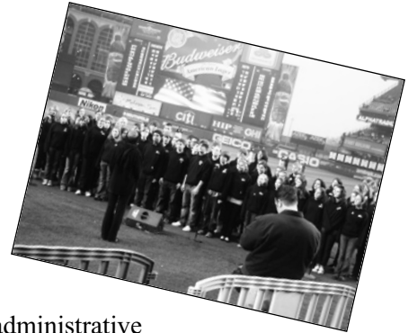
Shea Stadium New York City April 2008

P.S. I will follow up with a personal contact soon or you may telephone me at _____ at your convenience for more information.