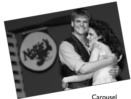
Carousel October 2008