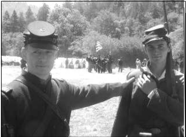
THE 1ST LIEUT. AND THE RECRUIT