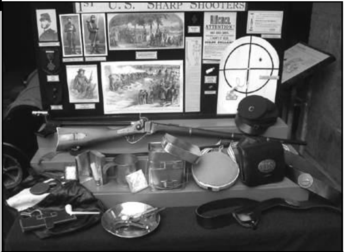
The Sharpshooter Display proved to big a big draw, once the band stopped playing!