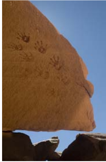
Ancient Hands, Grand Gulch, UT, 2006 Hands are a common theme in Rock Art. These ancient pictographs are located near Polly's Island in Grand Gulch. The nearby ruin overlooks both the Gulch and their handprints.