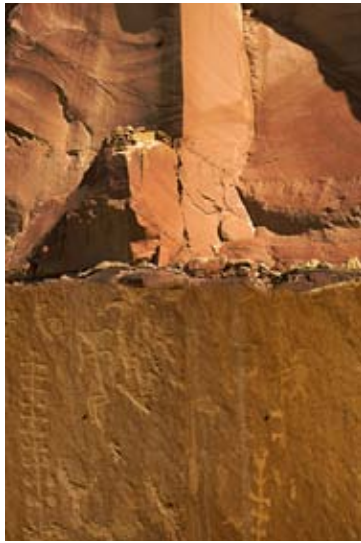
Top of the Comb, Comb Ridge, UT, 2008 Comb Ridge slowly rises like a wave to about 500 feet above the desert. This small site located at the very top of the Comb looks westward toward Cedar Mesa. The Rock Art is along the bottom of sandstone tower.