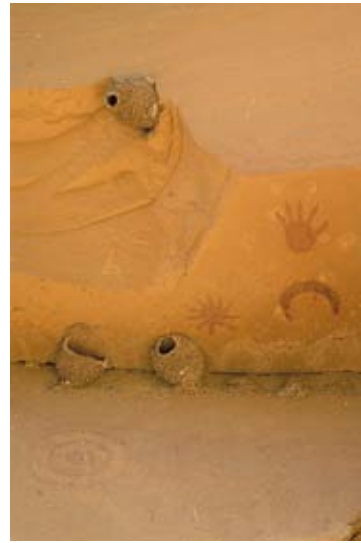
Super Nova, Chaco Canyon, NM, 2004 Located in Chaco Canyon National Monument, New Mexico, the Supernova pictograph is found along the trail to Peñasco Blanco. In 1054 A.D. astronomers noted an exploding star which corresponds to the date of this pictograph.