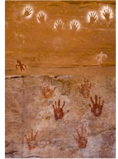
Fish Canyon, Cedar Mesa, UT, 2006 Grand Gulch in south-east Utah is rich with Anasazi history. Fish and McCloyd are two of many canyons filled with petroglyphs and pictographs. This composite unites hands and imagery from various locations.