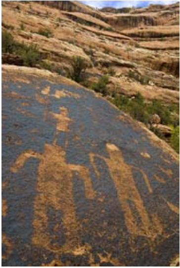
Road Canyon, Cedar Mesa, UT, 2008 Road Canyon is one of the many canyons in Cedar Mesa UT. This petroglyph is on top of a large flat rock along the canyon bottom.