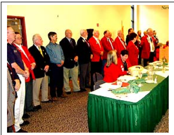
Veterans honored at 44-N Cabinet Meeting

Lions Youth Development of New Hampshire, Inc For MD-44 Youth Outreach A New Hampshire Non-Profit Organization (501C3) Your support is greatly appreciated P.O. Box 214, Northwood, NH 03261-0214