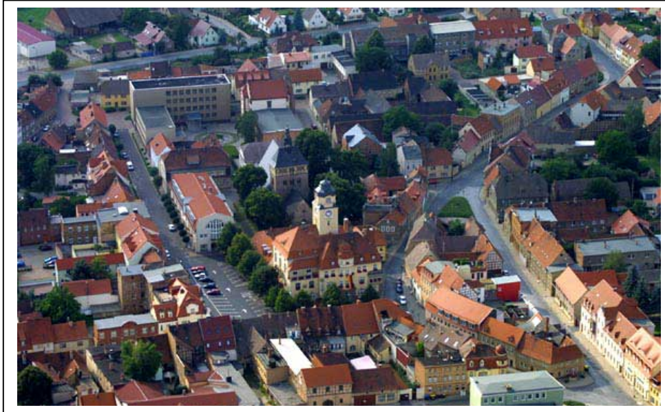
Artern city center

First, I would like to apologize for not having presented a column for November. I had led a group to visit Keene's Partnercity of Einbeck, Germany and the delegate from their three other Partnercities of Thiais, France (just south of Paris); Arten, a city from what was East Germany and Paczków, Poland. We had many activities in which we were involved together in and around Einbeck. Most important was that we got to really know not only the people from Einbeck (who I know very well) but also those from the cities the other Partnercities.