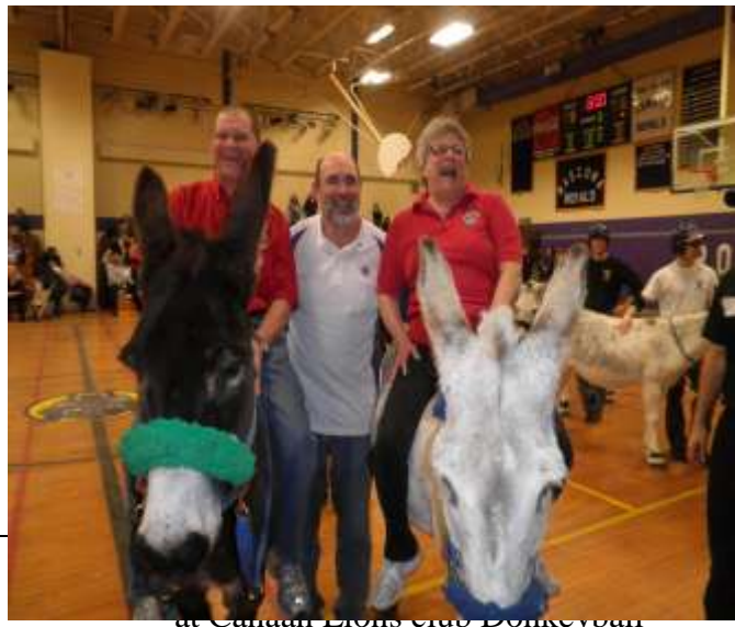
at Canaan Lions Club Donkeyball fundraiser.

The game is held each year to benefit Graduating Seniors Substance free after graduation party.