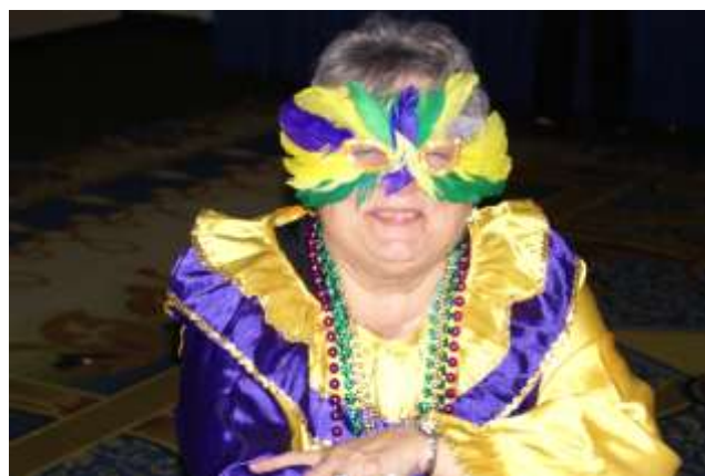
Madam District Governor Herself