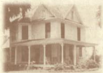
1 JENKS HOME (36 OAK AVENUE)