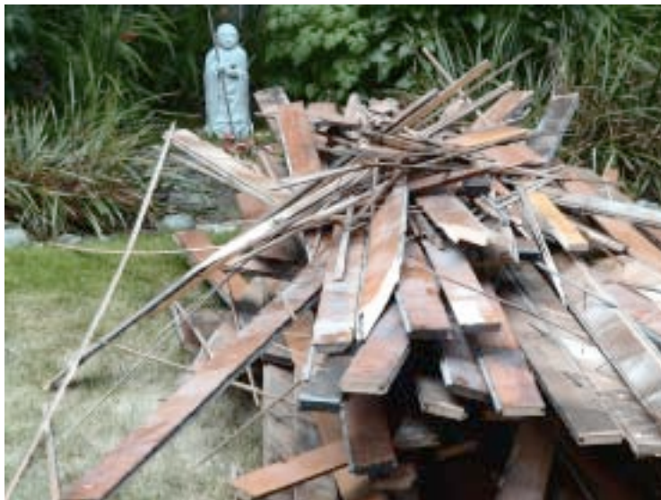
Tear-out of Old Zendo Floor on July 19th