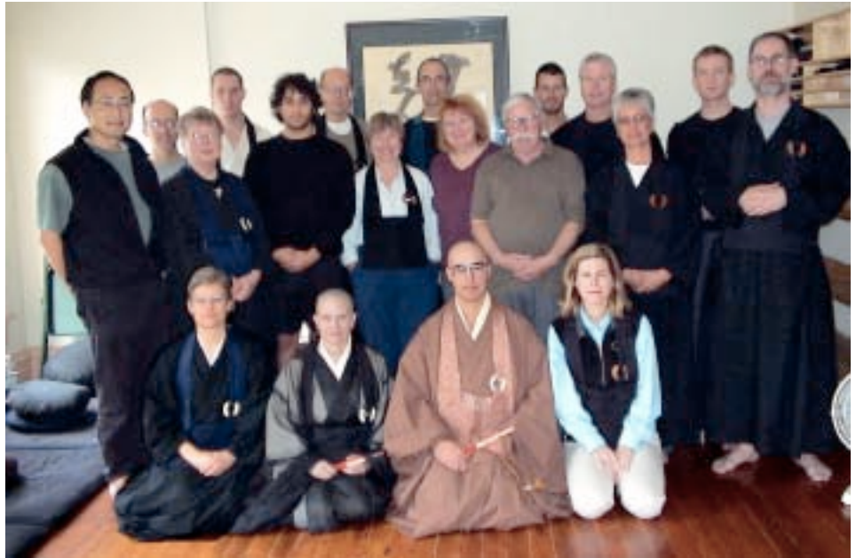
Summer Sesshin 2004 Participants

When you get to emptiness, self disappears; therefore, you can go no further. In the course of a Sesshin climb, we are at the peak. In other words, we’re as close to realizing our empty nature as we’re likely to be, and now we must do our best to absorb what is and be nurtured; soon we’ll return to the full complexity of our everyday life. If this sesshin is to have some value, we must make the most of our time together, and our time together is like water to the desert.